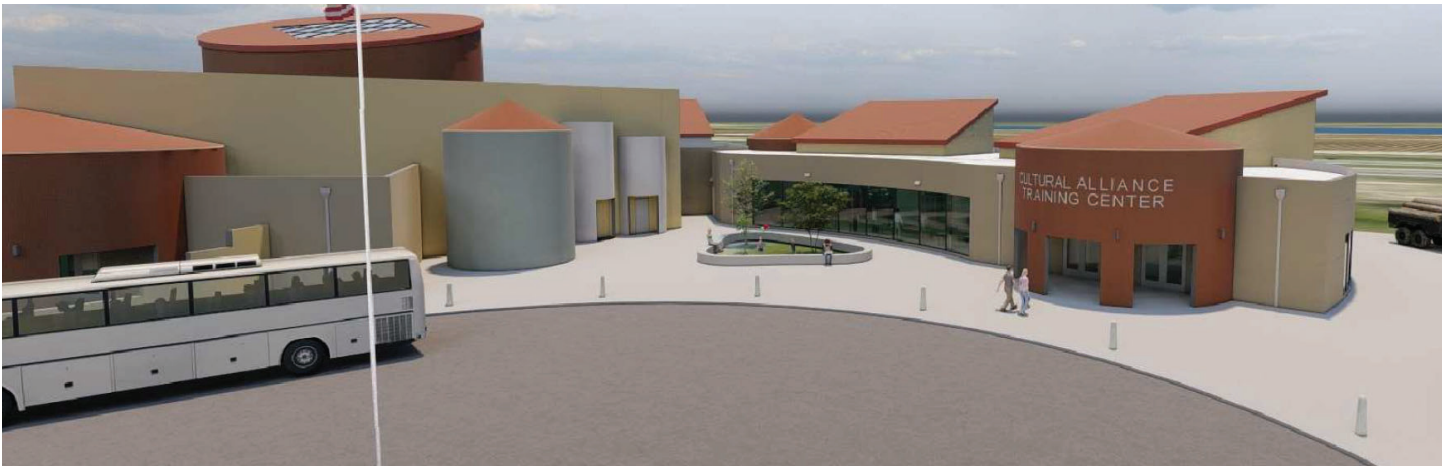
A conceptual rendering of the Cultural Alliance Training Center at SAGE. LKV Architects in Boise, Idaho is working with the Port of Morrow to design the new facility.

The Oregon Legislature ended their 2021 session with the passing of House Bill 5006, which appropriates funds for projects around the state. The Port of Morrow will receive $4.3 million for the construction of the Cultural Alliance Training Center at SAGE.