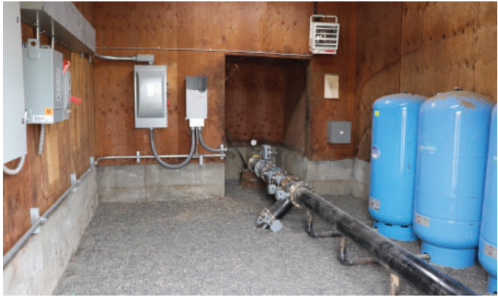
The South Morrow Industrial Park well at Heppner was recently updated with a VFD and PLC.

The Port is implementing a long-term project to upgrade control centers for existing pumps and stations. Programable Logic Controllers are a key piece of technology that adds remote access for monitoring and enabling real-time notification for alerts. Variable Frequency Drives are another element that reduces energy usage for pumps by adjusting the rate of flow based on demand.