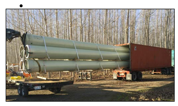
FALL 2016 PAGE 3 Volume 27 Issue 2