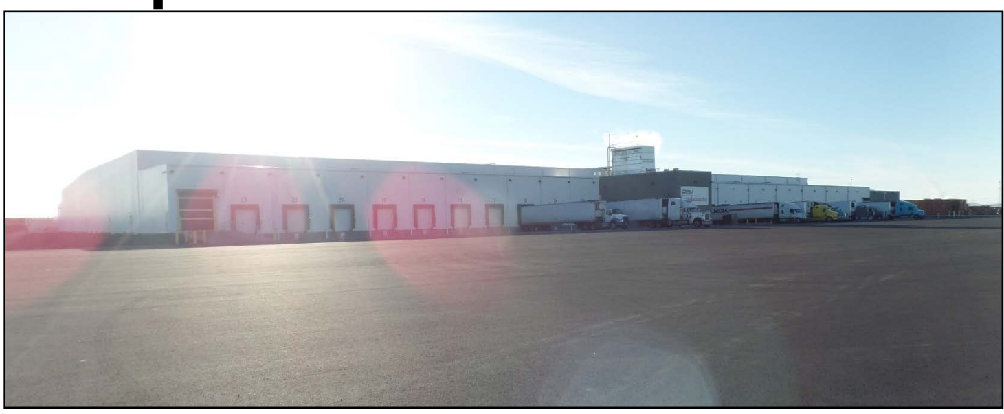
Newly Expanded Port of Morrow Warehouse