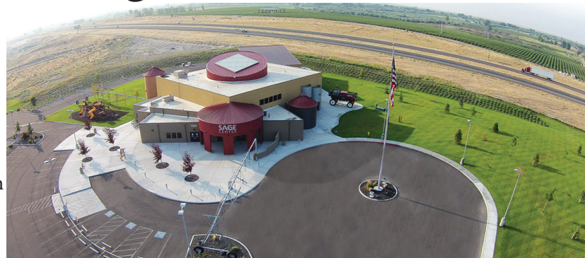
The SAGE Center recently joined Celebrate Oregon Agriculture to provide Morrow County agricultural information to a statewide audience.