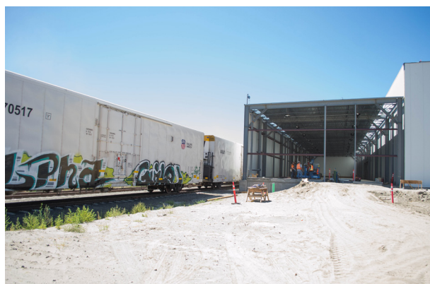
Above: The Port of Morrow Warehousing expansion is being added on to the east end of the existing facility that opened June 2015. The expansion will not only double the warehouse in size to 220,000 square feet, but will also increase capacity to about 85 million pounds of product.