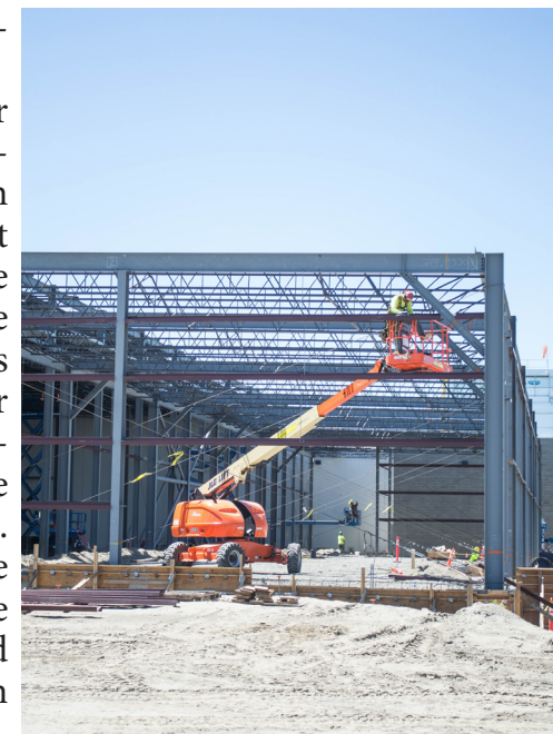
A construction employee works on a beam on what will become the truck dock on the Port of Morrow Warehousing expansion.

Other energy efficient items include high-speed roll-up doors, Variable Frequency Drives on drive motors and a completely automated refrigeration control system. Port of Morrow Warehousing prides itself on efficiency by